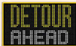
5W X 10H CHARACTER - UP TO 7 ACROSS