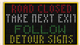
1 TO 4 LINES - UP TO 12 CHARACTERS PER LINE