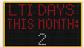
LOST TIME INJURY DISPLAY