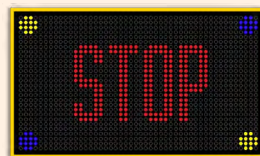
6W X 16H CHARACTER - UP TO 7 ACROSS