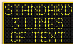
5W X 7H OR 5W X 8H - UP TO 8 ACROSS