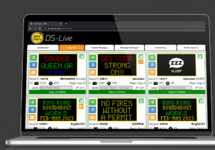
Remote Program & Control