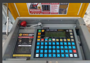
Local Program & Control