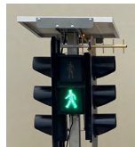
Pedestrian Crossing Lights also shown.

Can be factory fitted or supplied as a KIT that can be installed when required.