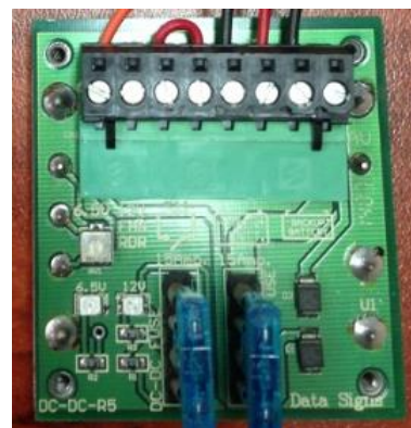
Controllers fitted with DC-DC convertors, either external or internal