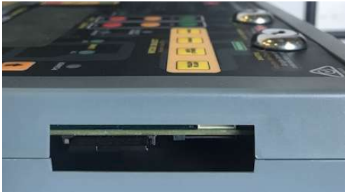
Current as at 20-05-2019