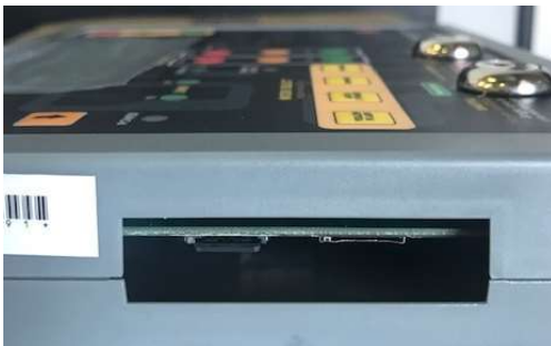
Current as at 20-05-2019