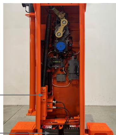
Built in charger