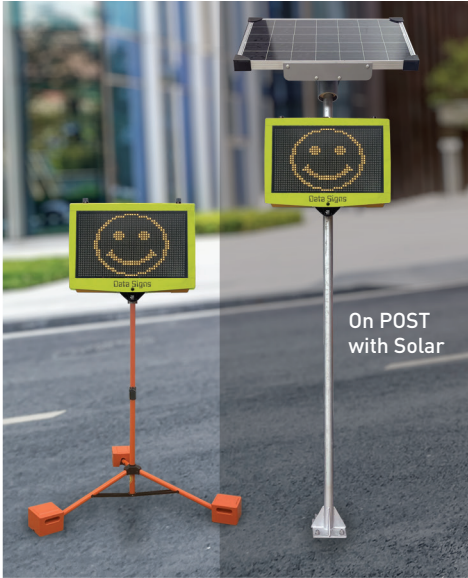
On POST with Solar