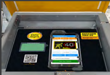
Local Program & Control