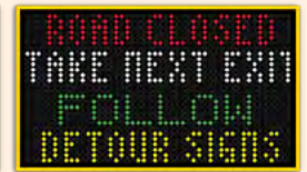
1 TO 4 LINES - UP TO 12 CHARACTERS PER LINE