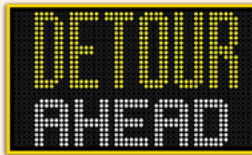
5W X 10H CHARACTER - UP TO 7 ACROSS