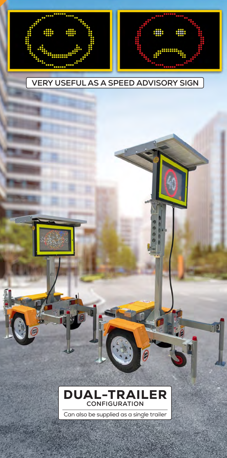
DUAL-TRAILER CONFIGURATION Can also be supplied as a single trailer