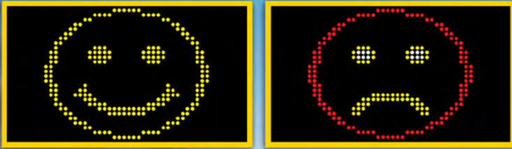
VERY USEFUL AS A SPEED ADVISORY SIGN

RAV Type approved for registration Approval number: VTA-060588