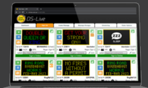
Remote Program & Control