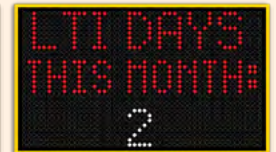
LOST TIME INJURY DISPLAY