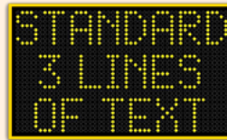
5W X 7H OR 5W X 8H - UP TO 8 ACROSS