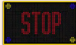
6W X 16H CHARACTER - UP TO 7 ACROSS